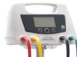
HUNTLEIGH Dopplex Ability Auto ABI System (123-8783)...Each