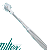
Miltex Miltex Pinwheel (953-5679)...Premium grade (110-2059)...OR grade (100-4520)...Mid-grade