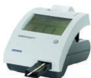
SIEMENS Clinitek Status®+ Analyzer Microalbumin (147-4712)...Test Strips Multistix Pro (147-2360)...100/Bt (147-8028)... 25/Bt

Medical Attention for Nephropathy • Foot Exam 2