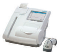
SIEMENS DCA Vantage Analyzer (147-8917)...DCA Microalbumin/Creatinine (147-8045)...DCA Hb A1c Reagents