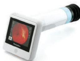
Welch Allyn RetinaVue™ (124-9168)...Each