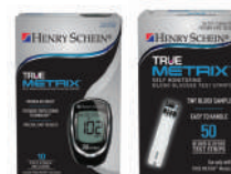
HENRY SCHEIN® TRUE Metrix Blood Glucose Meter (570-0330)...Each TRUE Metrix Blood Glucose Test Strips (570-0326)...50/Box